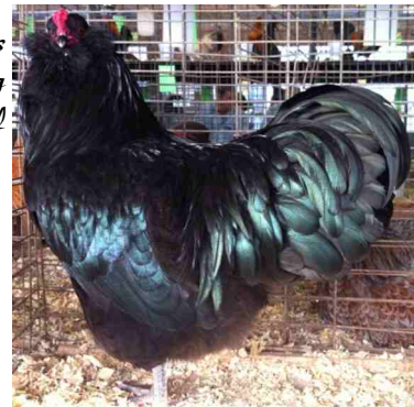
Clif's winning cockerel

No bantams and no junior birds were shown in the Arkansas meets.