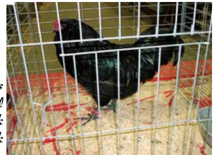
Gordan's large fowl black cock