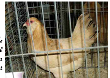
Gordan's large fowl wheaten pullet